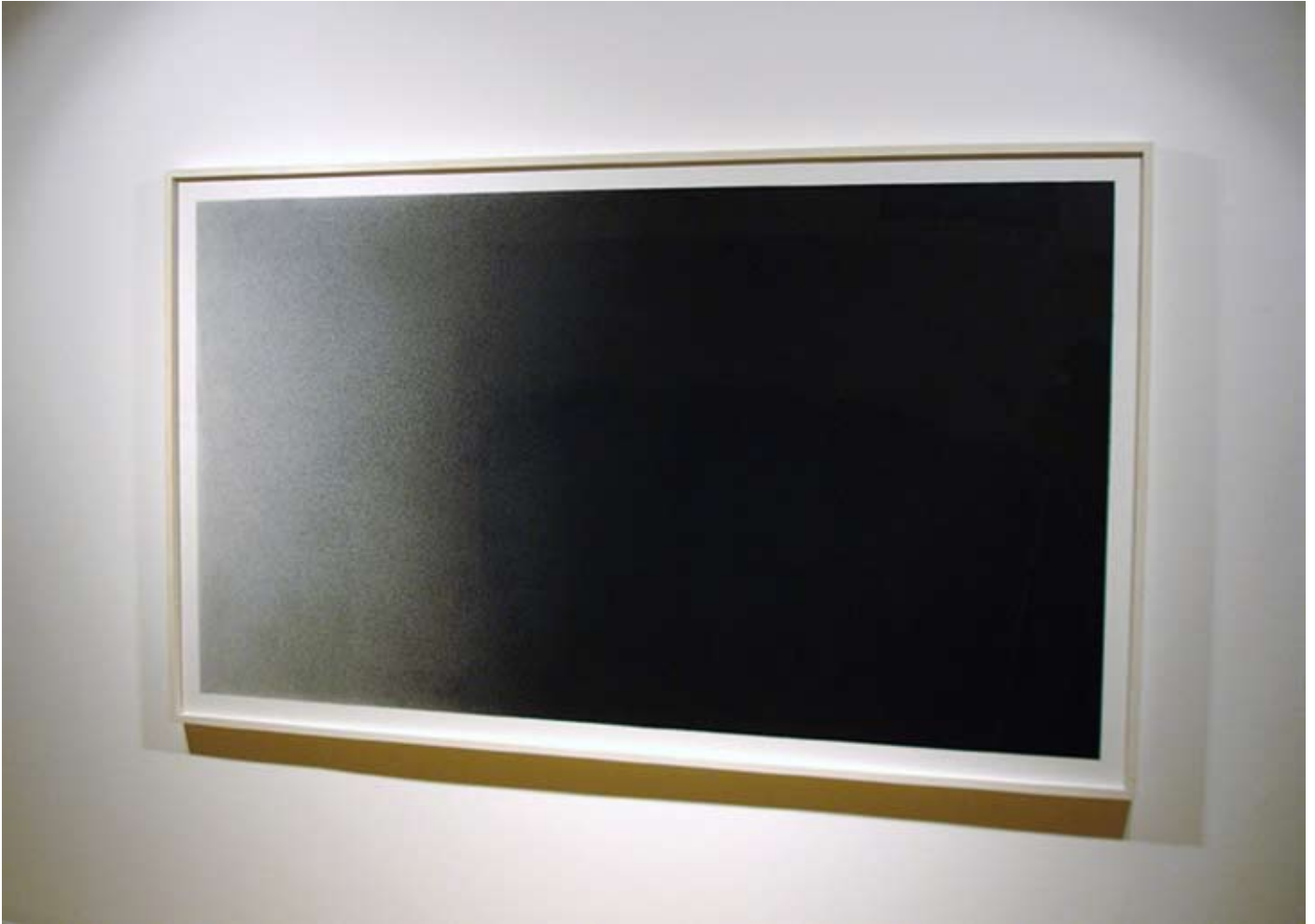
817,2 km de líneas aplicadas a un paisaje, 2005/2006