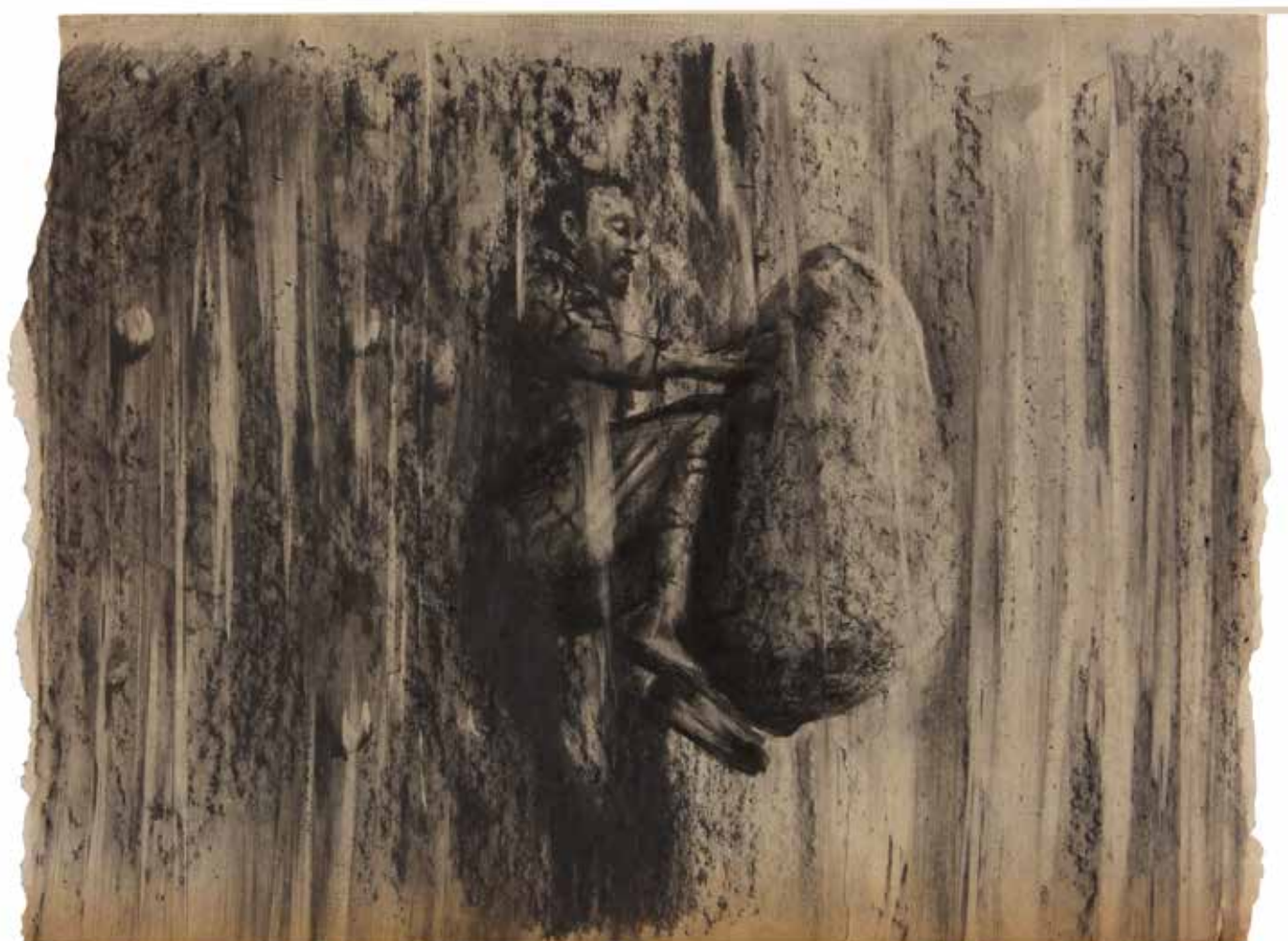
Sans titre , 2015 estado fallido Graphite and eraser on page of books 24,5 x 18 cm Unique