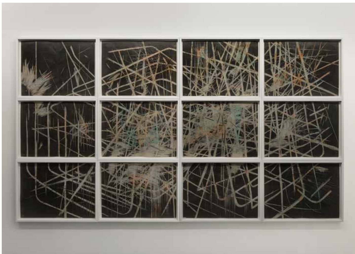
ATLAS CLASICO , 2013 Graphite and eraser on maps 100 x 175 cm Unique