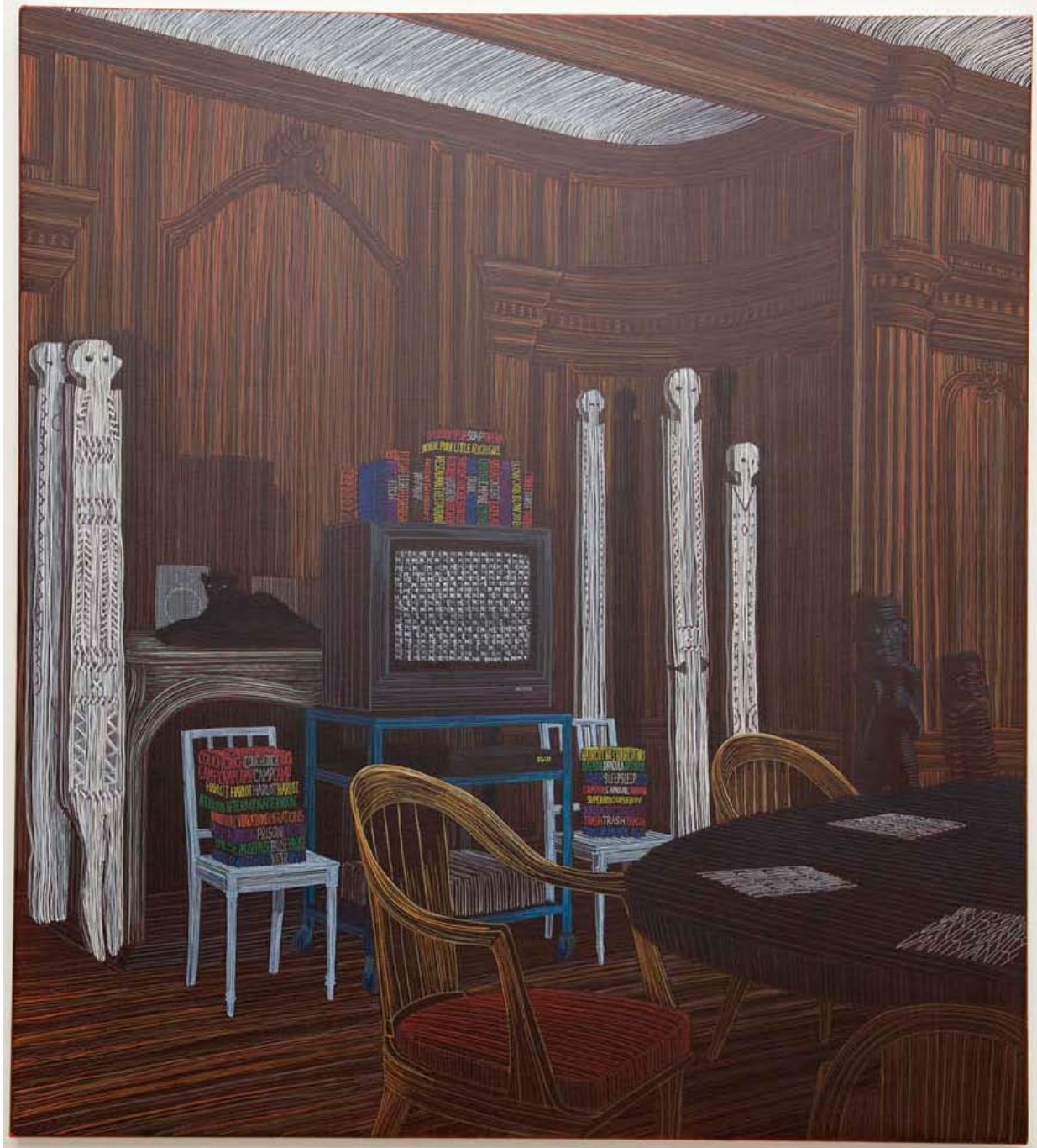
Reel World , 2013 Acrylic on canvas 100 x 90 cm