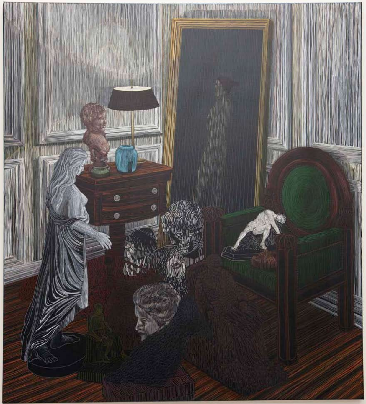
Not to Touch the Earth , 2013 Acrylic on canvas 100 x 90 cm