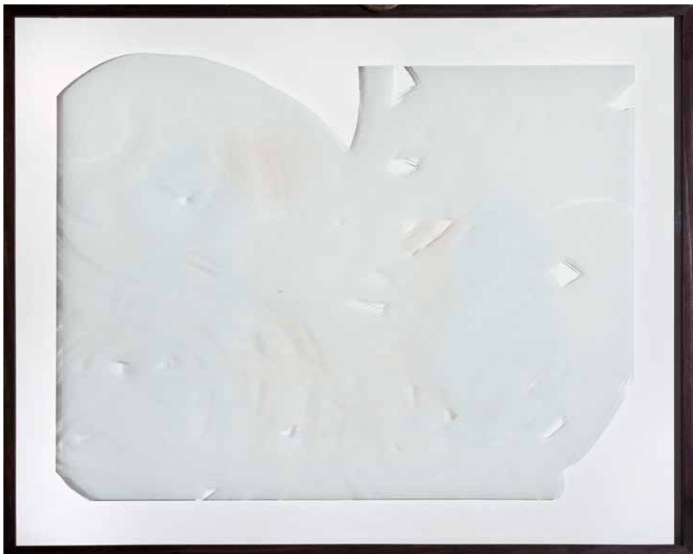
Rarely , 2015 Acrylic on glass 122 x 152 cm unique