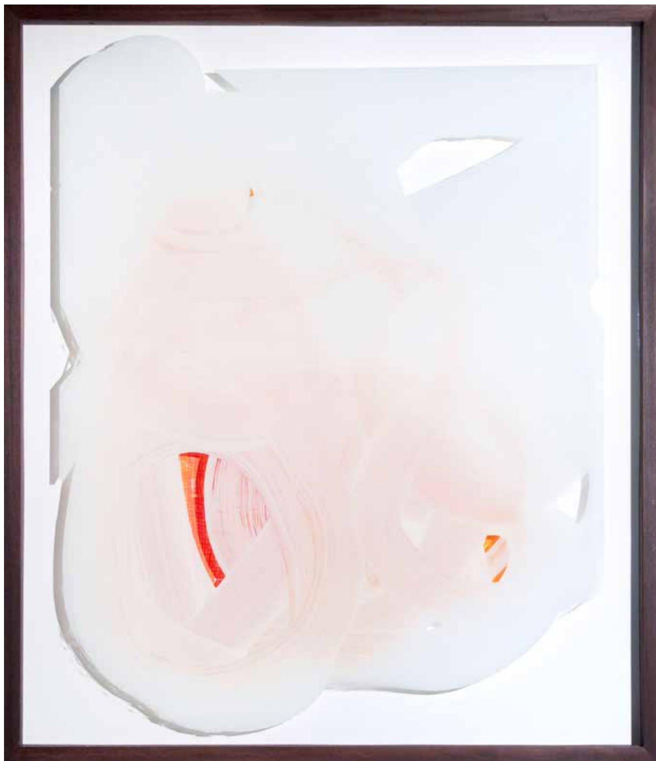
The Innocent Bystander , 2015 Acrylic on glass 110 x 95 cm unique