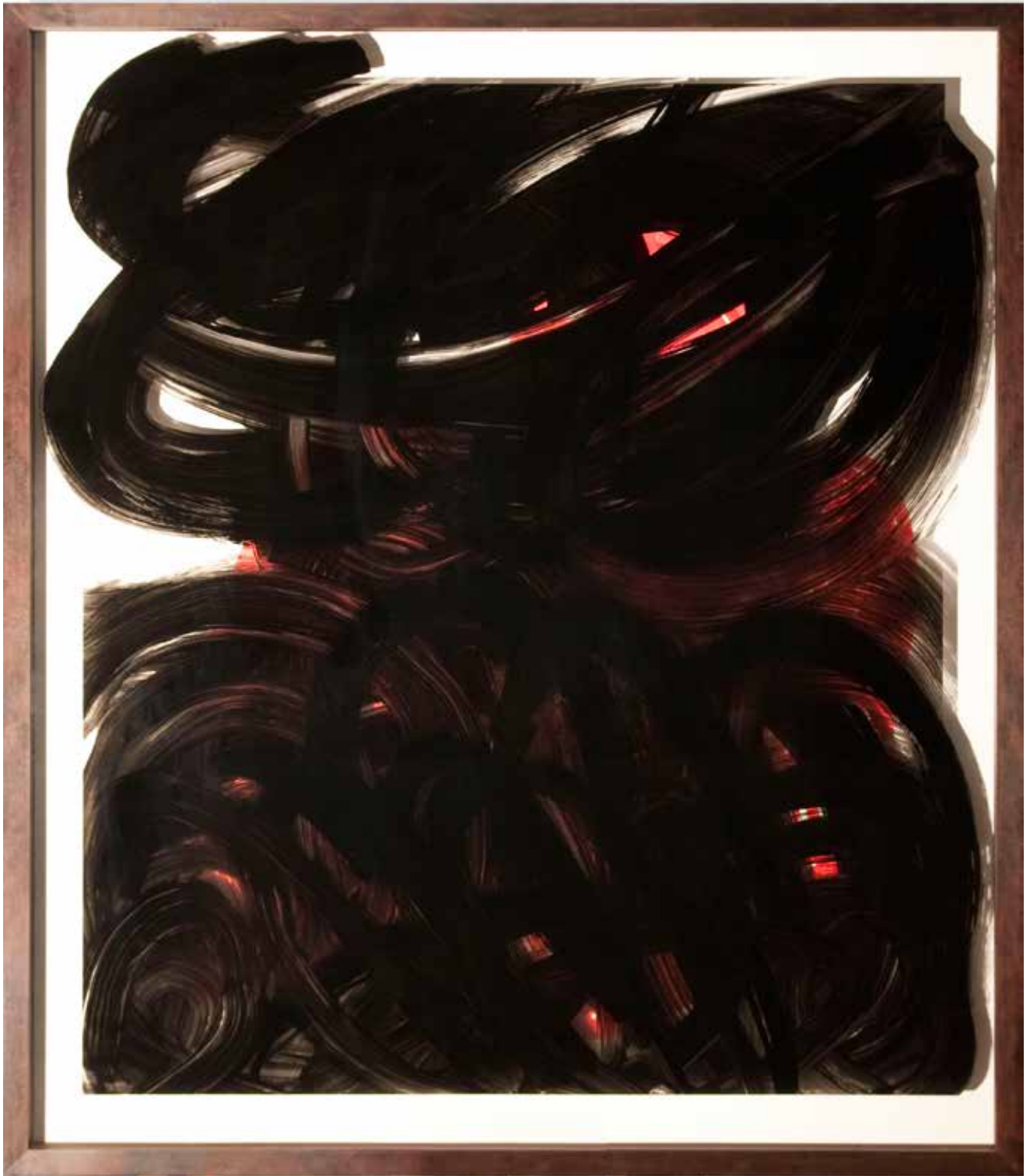
The Difference Between You And Me , 2015 Acrylic on glass 110 x 95 cm unique