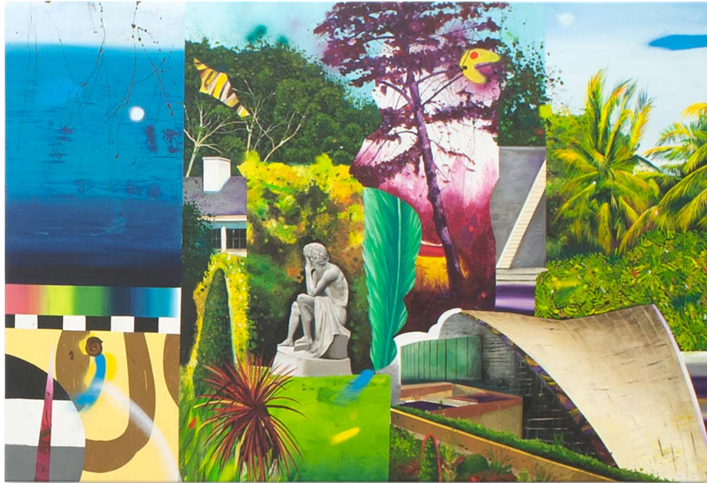
Iulian Bisericaru IL DISPETTO , 2019 Oil on canvas 95 x 140 cm Unique