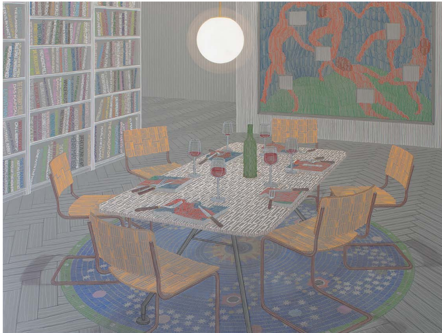
Thomas Broomé We only eat small pieces , 2020 Acrylic on canvas 120 x 160 cm Unique